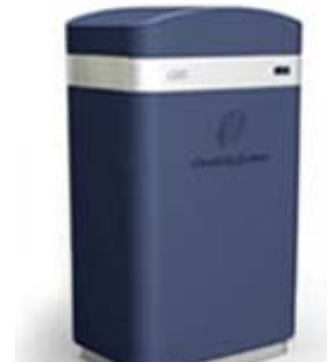
ClearEdge Power, Hillsboro