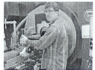
Solaicx - N. Portland