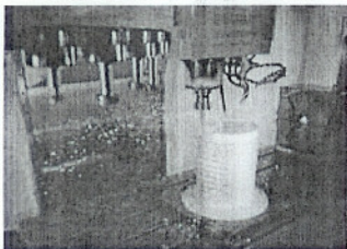
TOSOH Quartz, Inc-NW Portland/Beaverton