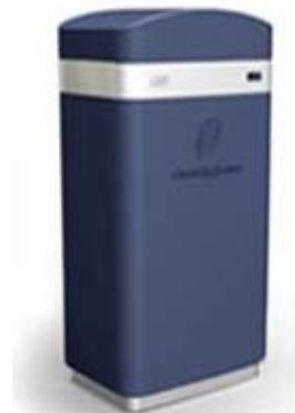
ClearEdge Power, Hillsboro